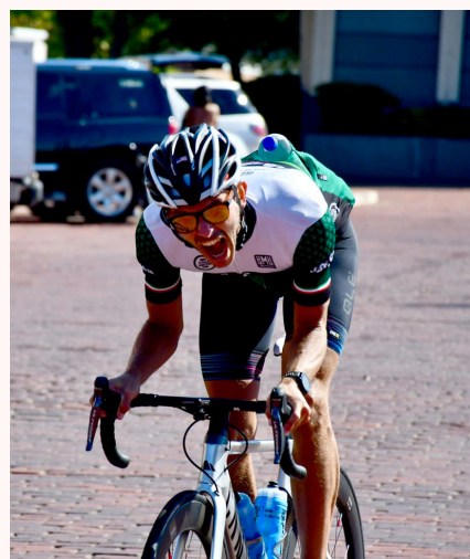
5K RACE & BIKE RIDE