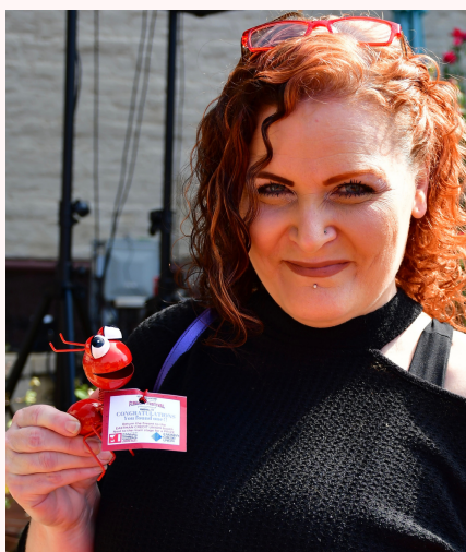
EYE SPY CONTEST