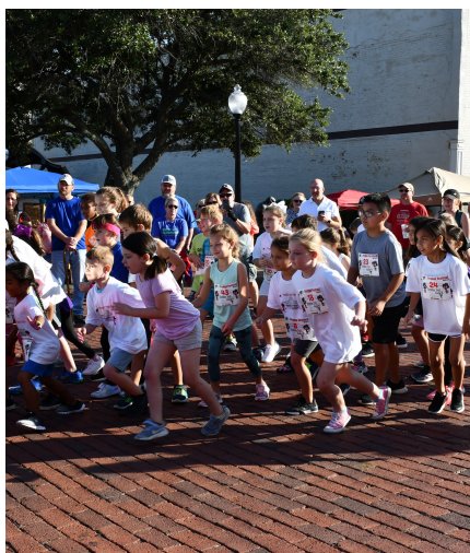
KIDS K RACE