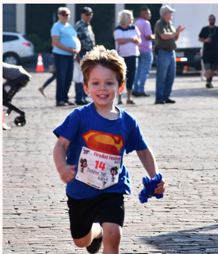
TODDLER TROT FUN